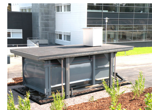
HABA MEGA in Helsinki

HABA MEGA has won several international innovation awards, and reference customers can be found in many large cities, such as Moscow, Dubai, Stockholm, Zurich and Helsinki.